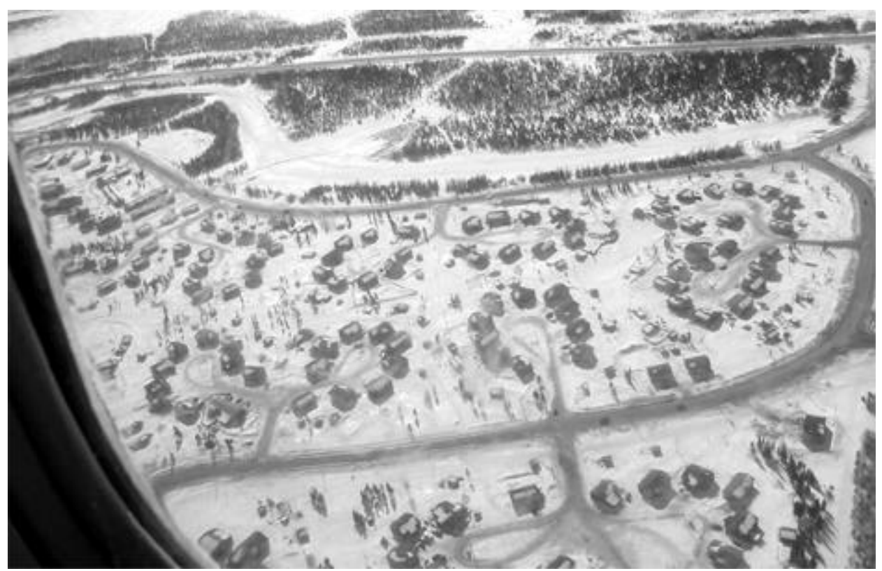
Figure 3. Clusters of modern houses in Chisasibi, a new Eeyou community created when the former village of Fort George was moved from an island in the La Grande River. With a little more than 3,000 residents, Chisasibi is the largest Eeyou community and home to the Cree Board of Health and Social Services and the region's only hospital.