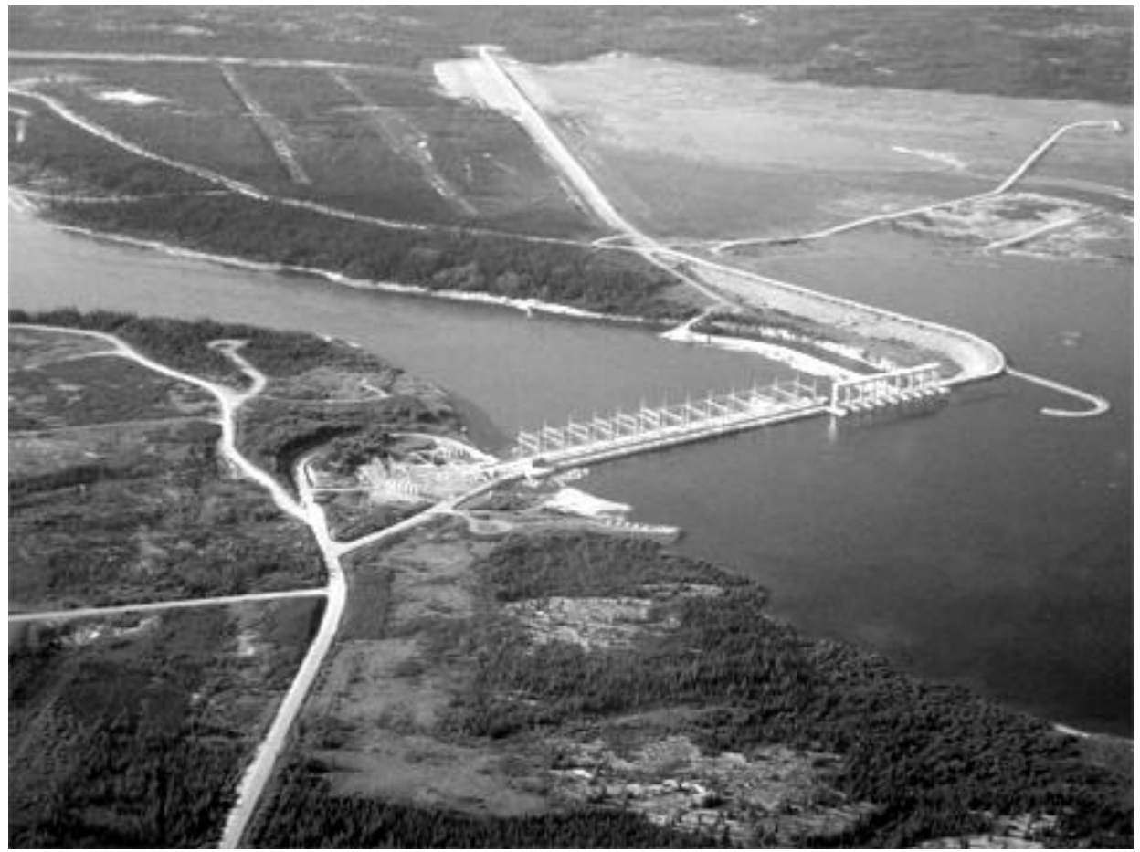
Figure 2. Part of the complex of dams and dikes that make up the La Grande Complex, the series of reservoirs and power-generating stations on the La Grande River in Eeyou Istchee.

In material terms, there is little doubt the Eeyou communities are better off than before the coming of the hydro projects and the signing of the JBNQA. In the 1960s, when Norman Chance (1968a) and others were studying the effects of development (mining and forestry) on the Cree in the southern part of the region, living conditions were compared to those of developing nations. Housing was inadequate, heating and plumbing systems were primitive (that is to say, wood stoves and buckets), and transportation was largely limited to motorized canoes, bush planes, and snowshoes (the skidoo entered the scene in the early 1970s). Many Cree men were beginning to work in the resource sector simply to earn a better living than they could off the land, even if it meant spending a good part of the year in work camps or non-Indian communities like Matagami and Dore Lake (Tanner 1968). However, as Tanner showed, more than half of all Cree families from the southern communities still spent their winters hunting and trapping in the bush, showing that the traditional subsistence economy remained strong well into the 1960s.