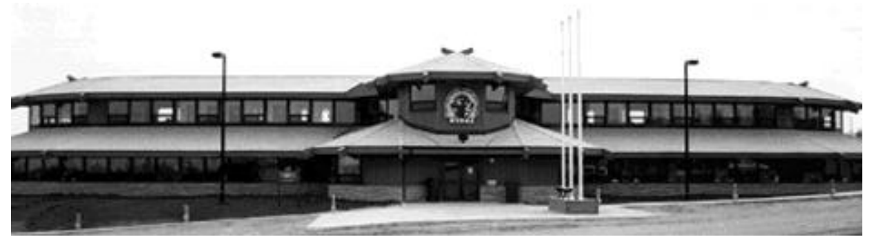
Figure 4. An example of the impressive architecture in Oujé-Bougoumou, the newest Eeyou community in Eeyou Istchee. The community's residents had long been displaced by forestry and other development and were living in scattered towns and villages throughout the region. Today Oujé-Bougoumou is a model of sustainable community design and is the future site of the new Cree Cultural Institute, Aanischaaukamikw.

On the negative side are an array of social, physical, and emotional problems related to rapid changes in lifestyle and other factors, some of which were identified nearly 40 years ago by the anthropologists studying the effects of development on the Cree (Chance 1968b; Sindell 1968; Wintrob 1968) and others that emerged in the context of newfound affluence