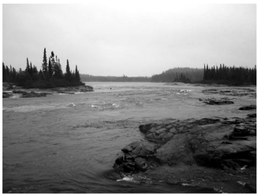
Figure 5 . Dead Man's Bones Falls, part of the Eastmain River that will be flooded by the EM-1 hydroelectric project, which was included under the New Relationship Agreement. Currently researchers are working to document the cultural heritage of the site using elders as teachers and training local residents in ethnography, archaeology, and digital media.

Not all Crees agree with this path or the way it was taken, however. Most controversial was the decision to allow the diversion of the Rupert River to provide more water for the La Grande Complex, a huge series of dams, dikes, reservoirs, and power-generating stations clustered in the La Grande River basin (Figure 5). This reflects a fundamental shift in the course of development of the James Bay territory, with Cree leaders now charting a course in tandem with their former rivals, Hydro-Québec. Meanwhile, the agreement is perceived by many younger Crees as undermining their political, cultural, and territorial sovereignty, which they see as more important than the economic objectives of the agreement. From their perspective it may be difficult to accept the claims of Cree leaders that the New Agreement actually improves their ability to control development or to build stronger mechanisms to support hunting as a way of life.